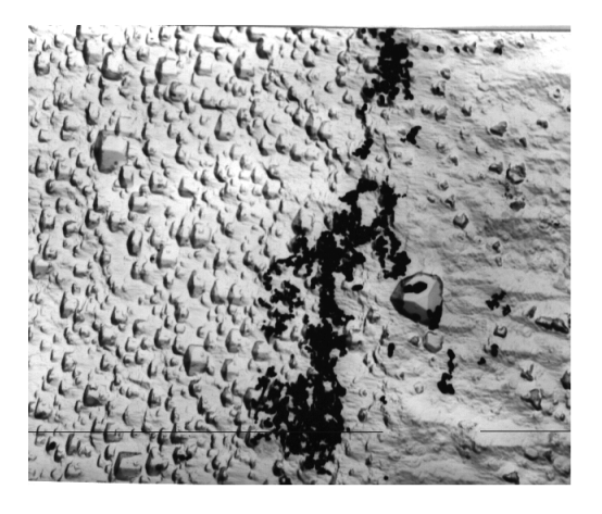
Figure 2. Topography of allocation of photolytic silver particles on the adjoining (100) and (111) planes of AgCl(Cu) crystals.